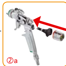
SATAminijet: insert the "mini dock" and slide in the "dis- play"