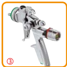
SATAjet 3000 B with SATA adam 2