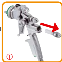
Remove air micrometer