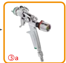
SATAminijet 3000 B with SATA adam 2 mini